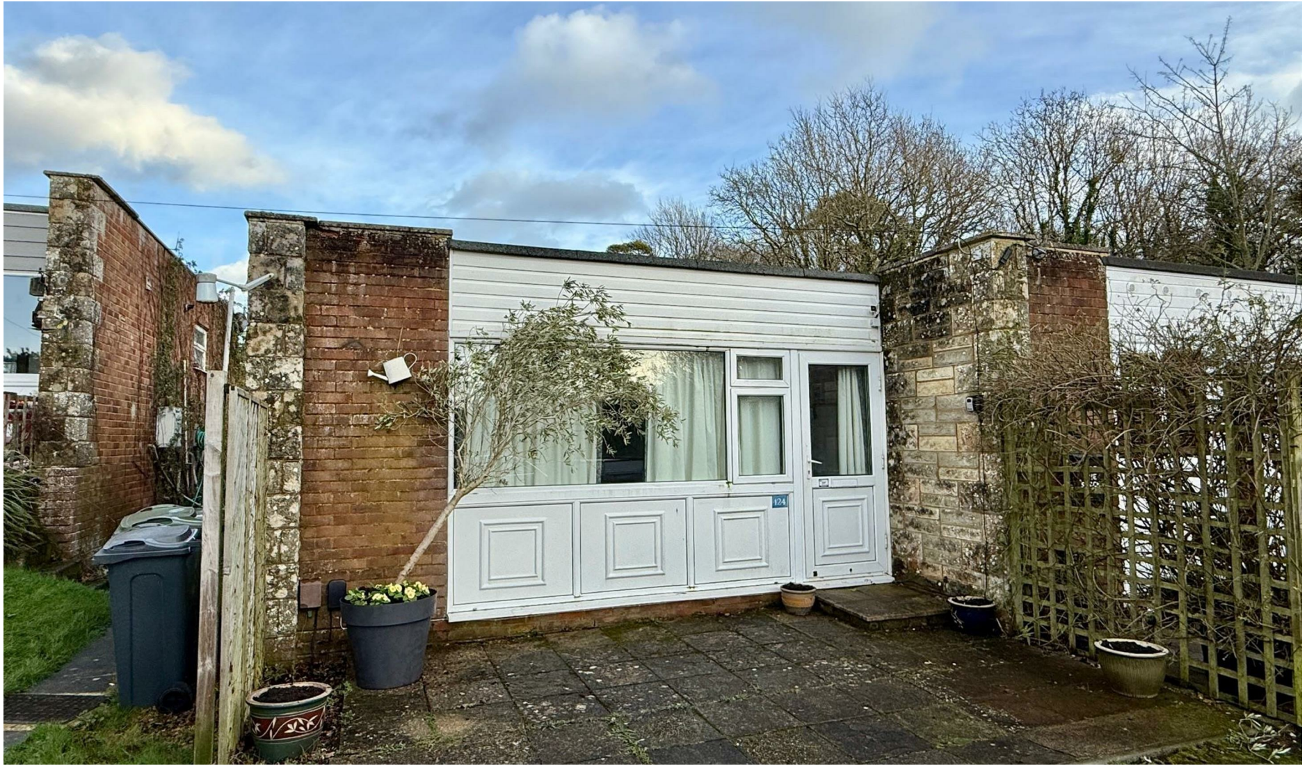
124 Gurnard Pines, Cockleton Lane, Cowes £52,000